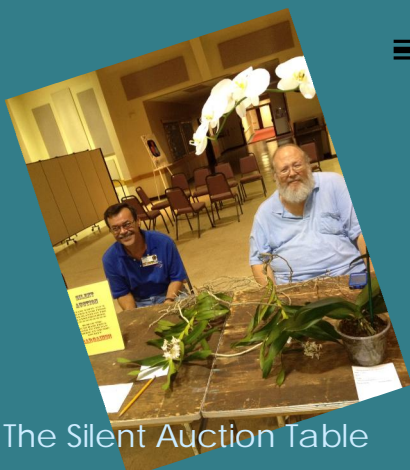
The Silent Auction Table