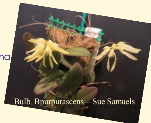
Bulb. Bpurpurascens—Sue Samuels