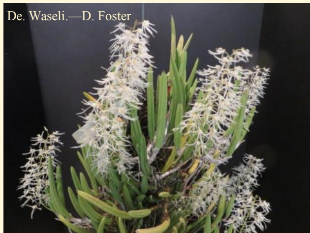
De. Waseli.—D. Foster

NEXT MEETING Tuesday, June 18 at 7:00 p.m. Pinecrest Gardens Hibiscus Room 11000 Red Road Pinecrest, Florida 33156