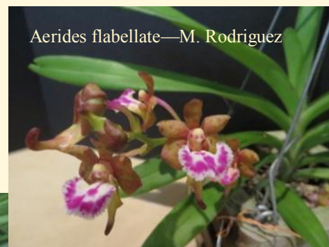
Aerides flabellate—M. Rodriguez