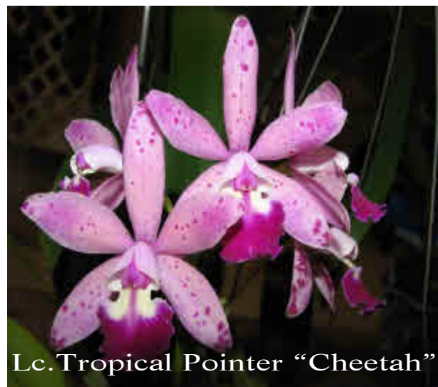
Lc. Tropical Pointer "Cheetah"

June 20. Volunteers to place orchids on trees outside the Church. The orchids donated on the 16 th will be placed on trees on the 20 th and the Church will need volunteers to assist with the project. This is not a day long assignment and any time you can donate will be greatly appreciated. Let Gio know if you will be available.