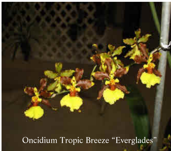
Oncidium Tropic Breeze "Everglades"