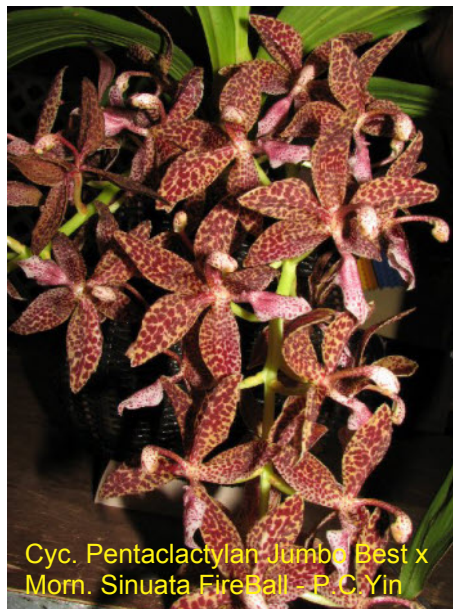
Cyc. Pentaclactylan Jumbo Best x Morn. Sinuata FireBall - P.C. Yin