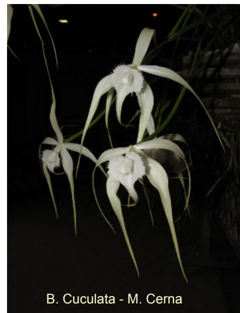
B. Cuculata - M. Cerna